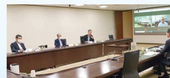
Round-table discussion among Outside Officers