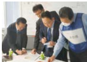
Simulation drills in response to a large-scale earthquake

In fiscal 2018, we once again expanded the range of products covered under the BCP. In addition, we conducted simulation drills based on large-scale earthquake and explosion scenarios targeting business supervisors and base managers, while all employees took part in safety confirmation drills. Going forward, we will continue to expand the range of products covered under the BCP while striving to raise awareness of and make ongoing improvements to it, thereby strengthening business continuity capabilities.