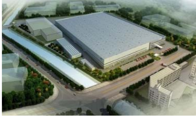
Dalian Fuji Bingshan Vending Machine No. 2 Plant Construction commenced in July 2016

Transfer complete line of production technologies—from sheet metal working to coating and assembly—from Mie Factory (domestic mother factory); introduce latest automated equipment for welding and assembly processes to realize efficient manufacturing (Total investment: Approx. ¥5.0 billion)