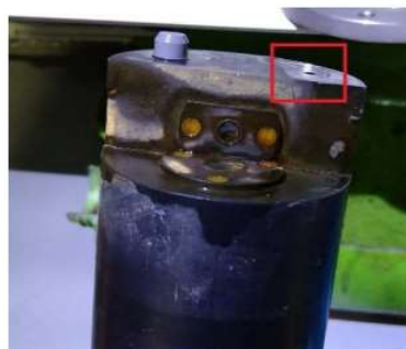
× Damaged condition