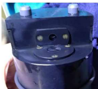
○ Normal Condition