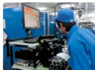
Circuit board testing