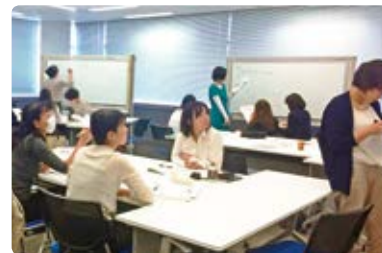
Career development support training

We have made diversity a top priority in our personnel strategy, aiming to incorporate an array of values and perspectives so we can strengthen our competitiveness and expand business globally.