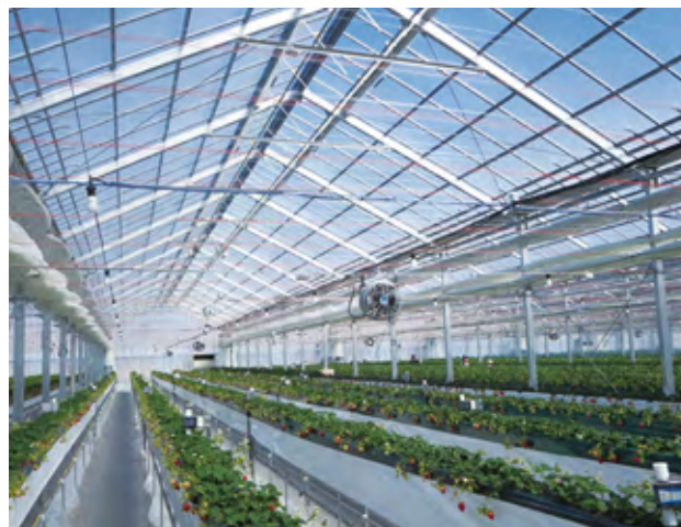
A large-scale, two-hectare greenhouse

Fuji Electric's entry into agriculture began nearly 20 years ago with the IT sector, but this is our first attempt at engineering a large-scale plant factory measuring two hectares. Plants are living things, and even when handled in a similar fashion, it is not always possible to maintain similar quality. In creating this system, we studied the agricultural expertise needed to create an optimal cultivation environment from the ground up. We also made repeated adjustments to arrive at the ideal combination of Fuji Electric facilities, equipment and