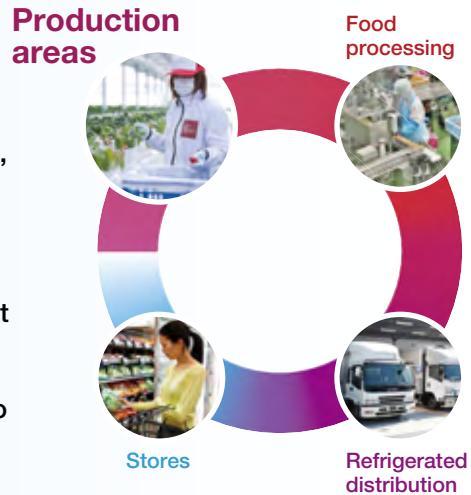
Smart food distribution chain provided by Fuji Electric

Using our experience in electric and thermal energy and plant control technologies, we are offering proposals for the various facilities, equipment, and information and control systems that support the engineering of plant factories. We also contribute to our customers' businesses by providing complete support for everything from business planning, to construction and operation, including growing and operational expertise.