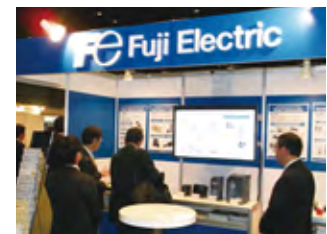
Introducing initiatives for international standardization at the Fuji Electric booth in the IEC (International Electrotechnical Commission) General Meeting in Tokyo.

Looking ahead, as we step up our IP activities overseas, we will also undertake strategic international standardization initiatives and contribute to the creation of new products and services, as well as market expansion.