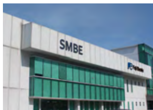
Fuji SMBE Pte. Ltd.

In addition to the distribution channels we have, SMBE's sales channels in the Asia-Pacific region and engineering capabilities will be utilized to increase the number of industrial plant and system projects that combine SMBE's low-voltage switchboards and Fuji Electric's power electronics. Moreover, we will also work to open new markets through production of medium-voltage switchboards.