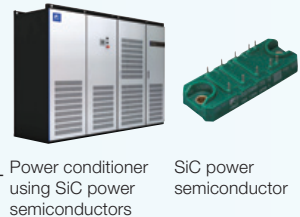
Power conditioner using SiC power semiconductors

Following this achievement, in May 2014, we announced the launch of a large-capacity power conditioner for mega solar power generation using SiC power semiconductors (sales scheduled to begin in August 2014).