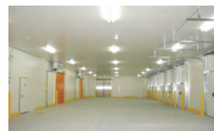
Goods disposal space at the distribution center. The room is kept at low temperatures

The refrigeration technology that Fuji Electric cultivated in vending machine and refrigerated showcases over the years and its expertise in designing and constructing stores and warehouses has enabled it to support the retail industry from the distribution side to help make lifestyles more convenient.