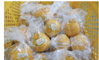
The dekopon, a local speciality of Kumamoto Prefecture