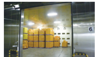
Warehouse where temperature is maintained by a refrigeration facility

This setup meticulously manages refrigerator temperatures as stored fruit volumes fluctuate and workers open and close doors during shipment times. The system warns managers of any abnormal refrigeration conditions.