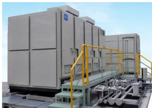
Demonstration test units

FE is committed to contributing to the creation of a responsible and sustainable society through innovation in the energy and environment business. Under its Environmental Vision 2050, which aims to achieve zero environmental impact, including decarbonization and transitioning to a circular economy, FE aims to contribute to the achievement of a decarbonized society, a recycling-oriented society, and a society that is in harmony with nature by expanding the use of FE's innovative clean energy technologies and energy-saving products. In this context, in the hydrogen and ammonia field, we promote the development of power supply systems for water electrolysis and measuring instruments, in addition to fuel cells.