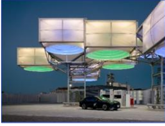
Toagosei Hydrogen Station Tokushima