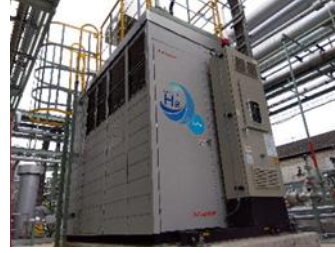
Hydrogen-fired boiler installed in Nagoya Plant