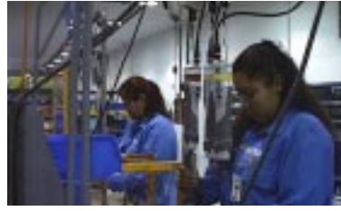
GE Fuji Drives America S.A. de C.V.

Since the previous fiscal year, Fuji Electric has rapidly built up its presence in the Chinese market. Steady efforts are continuously being made in the current fiscal year, focused on the ED&C and drive systems area. In 1997, we established two joint venture companies with a local partner in China—Shanghai Fuji Electric Switchgear Co., Ltd., which produces vacuum circuit breakers and panels, and Shanghai Fuji Electric Transformer Co., Ltd., which manufactures cast-resin molded transformers. Both of these firms commenced full-scale operations in May 1998.