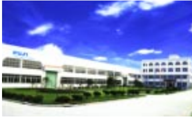
Shanghai Fuji Electric Switchgear Co., Ltd.