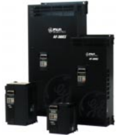
General-purpose inverters that Fuji Electric began marketing in an international alliance with GE of the United States

In the energy area, we are actively forging and reinforcing alliances with overseas corporations. In the thermal power generation area, we are strengthening a cooperative business relationship with Siemens AG and we will maintain efforts to secure orders in Japan and abroad. We have won orders, mainly in Southeast Asia, for full turnkey projects involving the construction of thermal power plants. In the hydropower area, we aim to enter the pumped-storage hydropower equipment market in Japan and to obtain orders for hydropower plants in the Asian region. We have formed a joint venture company, Voith Fuji Hydro K.K., with the German company Voith Hydro GmbH, one of the world's top manufacturers of hydro turbines, and we will endeavor to cut costs through streamlining and to boost our competitiveness in this field. While strengthening our business tie-ups with such leading international manufacturers, we aim to acquire the latest technological expertise and foster a more international perspective. At the same time, we plan to expand our world market share to be a global player in the market.