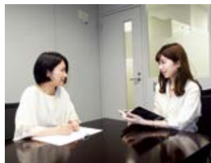
Meeting held as part of the mentor system for women employees

The Company deployed a project for promoting hiring of women with educational backgrounds in science and engineering and also offered internships to help it secure such employees.