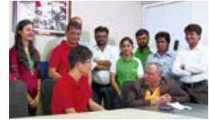
Locally hired staff at Fuji Electric India Private Ltd.

other parts of Asia. These practices help us develop businesses that are closely tailored to the countries and regions in which we operate.