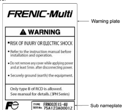
Figure 1.3 Warning Plate and Sub Nameplate