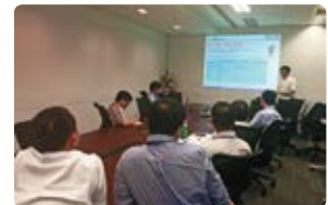
Patent meeting at Fuji Electric (China) Co., Ltd.

Looking ahead, as we step up our IP activities overseas, we will undertake strategic international standardization initiatives.