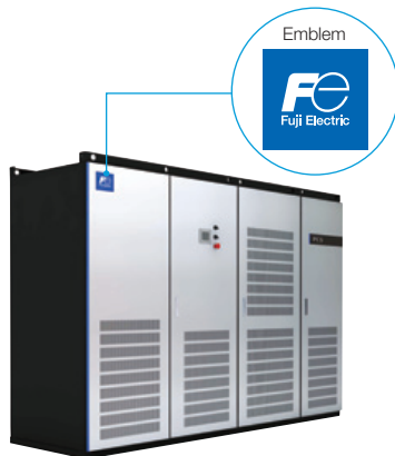
An example of applying the emblem on our power conditioner

To raise its corporate value, Fuji Electric is stepping up its efforts in product design.