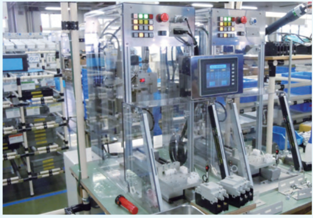
Automated screw tightening system

We have developed simple automated systems that automate tasks in the breaker assembly process, such as tightening screws and affixing nameplates, at a low cost. We have made screw tightening tasks more efficient by having workers supply the screws and machines perform the screw tightening process. Going forward, we will expand these production technologies globally by applying this system to factories overseas.