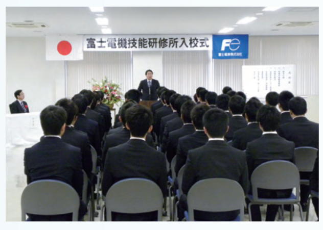
An induction ceremony at the Technical Training Center

In technical training for new employees, trainees learn the fundamentals of manufacturing through a year-long dormitorybased training curriculum. From April to August, new employees learn basic tasks such as soldering and tightening screws. From September, the trainees acquire specialist knowledge in electronic devices, machining and other fields. Among the total of approximately 1,800 hours of education and training received, the trainees undergo 1,400 hours of certified training toward the final goal of obtaining qualification. The goal is to train employees who can start contributing immediately after they are assigned to their work stations.