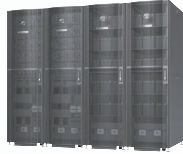
Develop global products such as compact inverters (left) and uninterruptible power supply systems (UPSs) (right) to expand business in