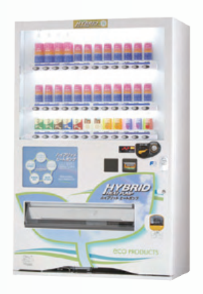
Hybrid heat-pump vending machines significantly reduce power consumption

In store distribution, we will strive to grow orders for store equipment from supermarkets and convenience stores. We will also take steps to expand into new fields such as refrigerated distribution, providing total solutions that leverage our cooling technology to cover every part of the journey from where food is produced to where it is consumed.